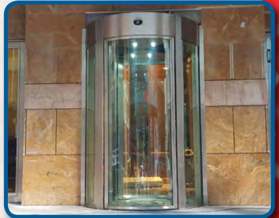
ANTI-BANDIT DOORS & BULLET PROOF PANELS AK47, 7.62 X 39 API, 4 SHOTS FROM 30M